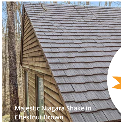
Majestic Niagara Shake in Chestnut Brown