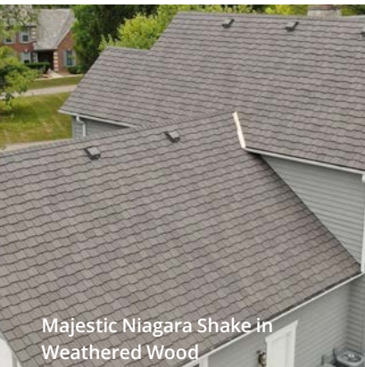
Majestic Niagara Shake in Weathered Wood