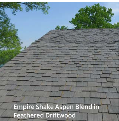
Empire Shake Aspen Blend in Feathered Driftwood