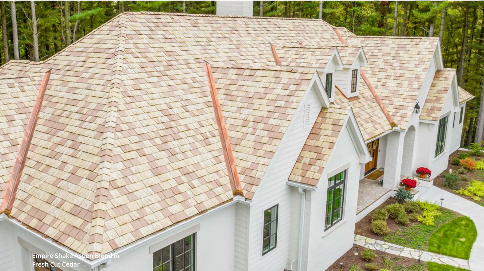
Empire Shake Aspen Blend in Fresh Cut Cedar