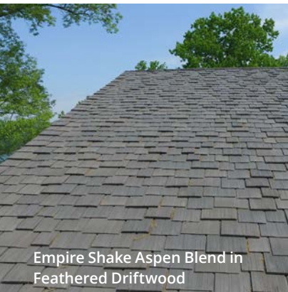
Empire Shake Aspen Blend in Feathered Driftwood